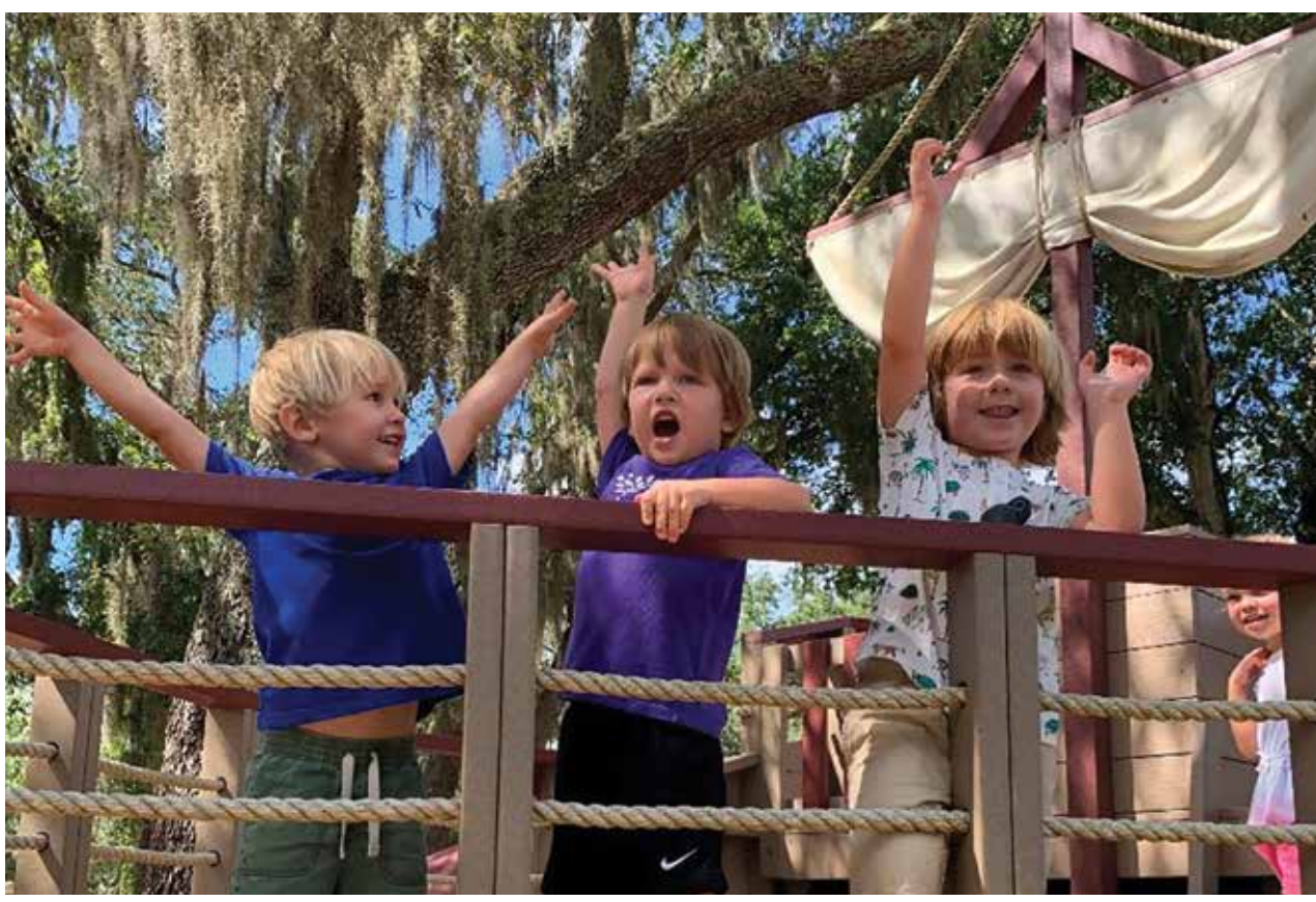
Winter Park Presbyterian Preschool students are happy to be able to play again on the ever-popular pirate ship.

It is truly wonderful to have children back in our school, and we are grateful to all of our families for their support. Every day here is truly a blessing.