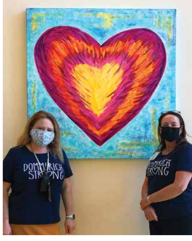
Pictured above, staff from Dommerich Elementary mask up for the new school year.

Dommerich Elementary welcomed LaunchEd and Face to Face students to the new 2020-21 school year.