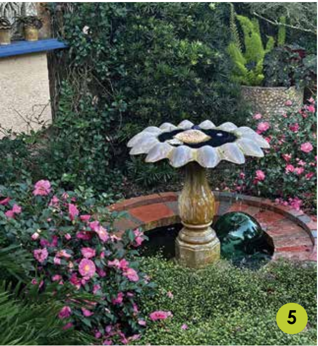
1. Campania International's Aspara planter with Angkor Red finish. 2 Chanticleer Garden's Tea Cup Garden awaits. 3. The Farnley planter in rust finish from Campania International. 4. A striking water feature at Villa Noailles in Grasse, France. 5. Our recirculating birdbath was inspired by one in the Villa Noailles garden.