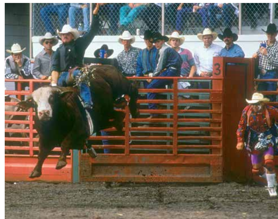
Yee-haw! The Silver Spurs Rodeo returns February 17-19 at the Osceola Heritage Park in Kissimmee.