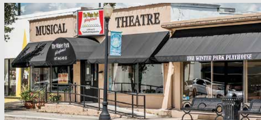
The Winter Park Playhouse is located at 711 N Orange Ave, Winter Park, FL 32789.

The Winter Park Playhouse is a registered 501(c)(3) non-profit charitable organization and proudly affiliated with Actors' Equity Association and The National Alliance for Musical Theatre.