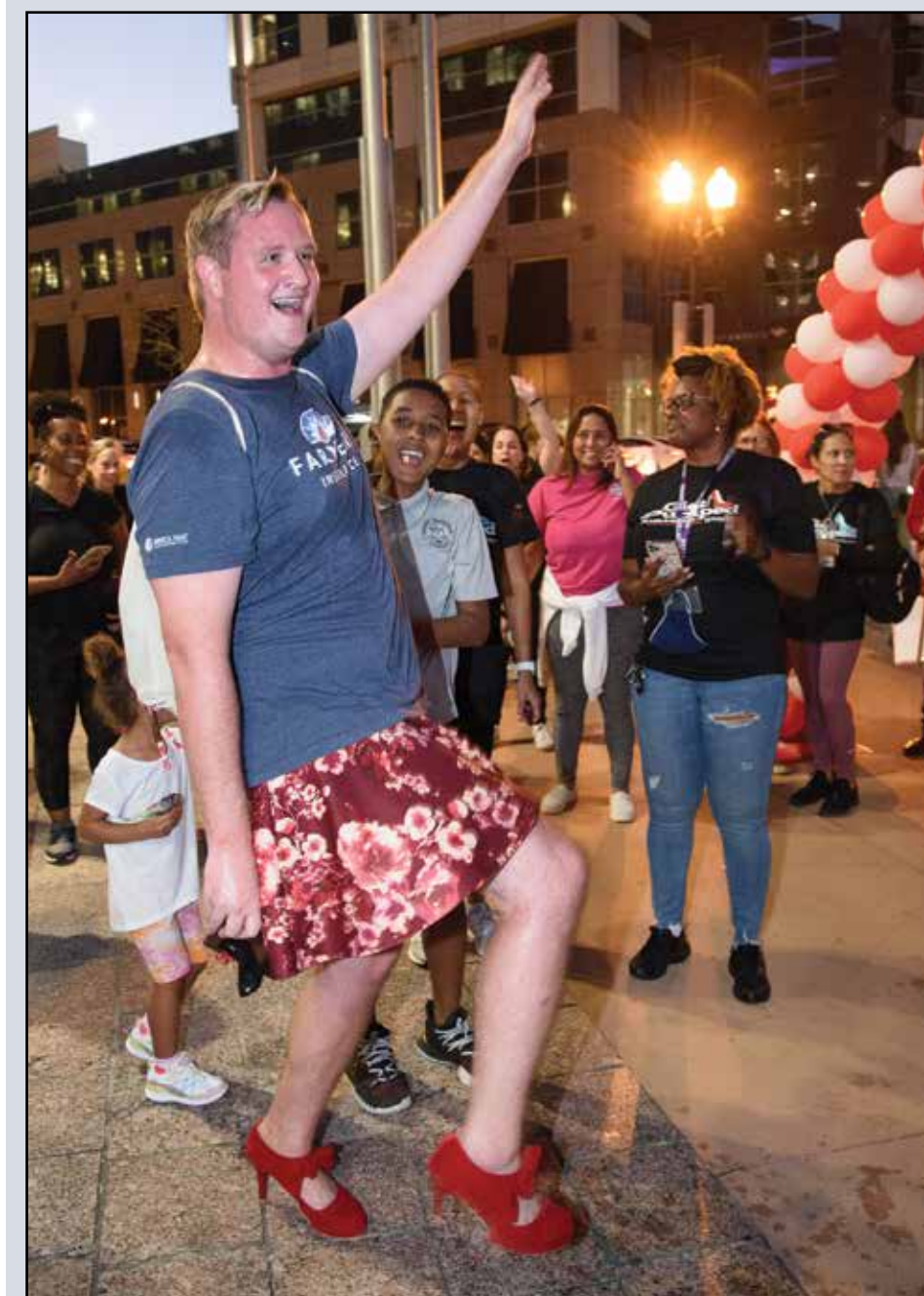
Crossing the finish line in style.

For more information and registration, please visit https://www.harborhousefl.com/walkamile .