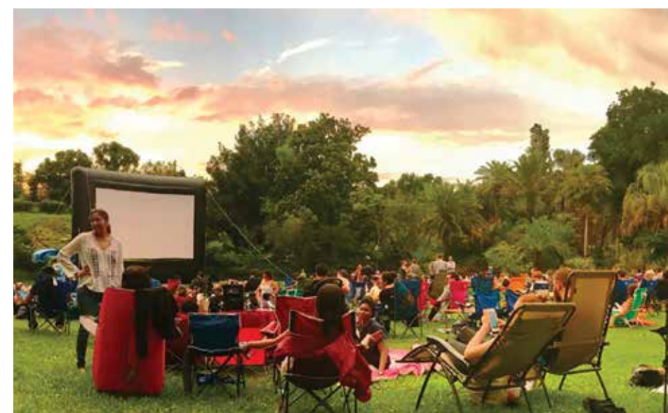
Leu Gardens will host their annual Valentine's Day Date Night on Tuesday, February 14 with the movie "As Good As It Gets."

Another great way to celebrate our neighborhoods is by joining the city's monthly Community Connections Workshop on February 11th. This month the conversation will be about best practices for neighborhood organizations. Leaders will share their learned knowledge and best practices on a wide variety of subjects, from opening a bank account and getting a Tax ID, to successfully securing city and county grant funding, and hosting the kind of events neighbors want to come out to. Visit Orlando.gov/events for more information.